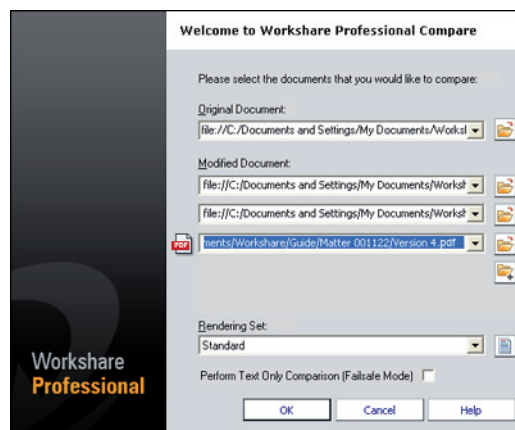
Figure 2: The 1 to Many Comparison feature in Workshare Professional allows you to compare your master version with multiple versions in one single view.