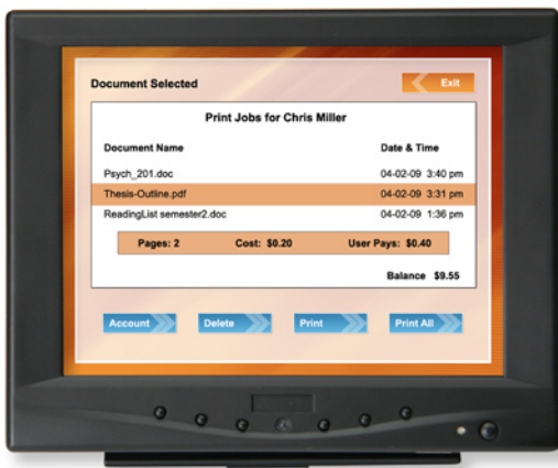
Uniprint print release screen

Secure Release Here® is a powerful Uniprint application that enables a new, two-step printing workflow. Users submit print jobs from their computers in the usual way. At the printer, they use the Pharos interface to select the jobs they want to print and "release" them. The benefits of this new workflow are cost and waste reduction, security, and flexibility: